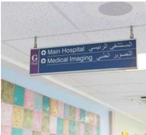
Figure 4.5: Corridor directional sign, ceiling mounted

Directional signs in the Main Entry area, Foyers, Lift Lobbies and public amenities areas may include braille lettering for the visually impaired. If provided, it is recommended that signs with braille should be located immediately above the hand rail.