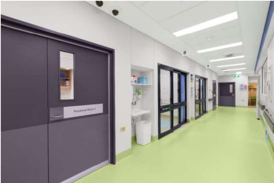
Figure 4.10: Room/ Door Signs and bed number signs outside the entry to the bed space