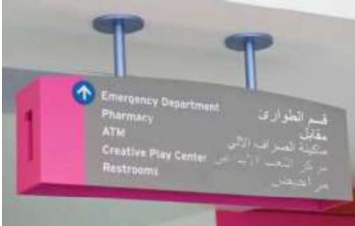
Figure 4.7: Viny-cut lettering sign