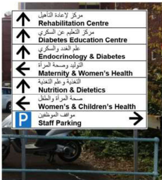
Figure 4.4: Example of external building signs

It is recommended that external directional signs have large letters on a contrasting background colour. External signs should be constructed of steel or aluminium if possible and be weatherproof.