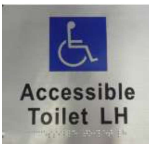
Figure 4.3: Room Sign with braille

Braille and Tactile signage are recommended for all signs within reach range.