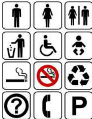
Figure 4.2: Internationally recognised pictograms used in Signage

Internationally recognised symbols (pictograms) in lieu of room titles are recommended as these are universally understood.