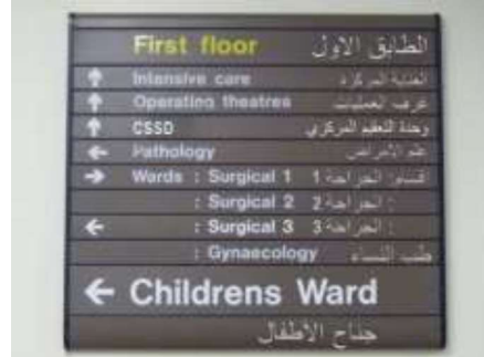
Figure 4.8: Removable slat type signs, with a locking cap